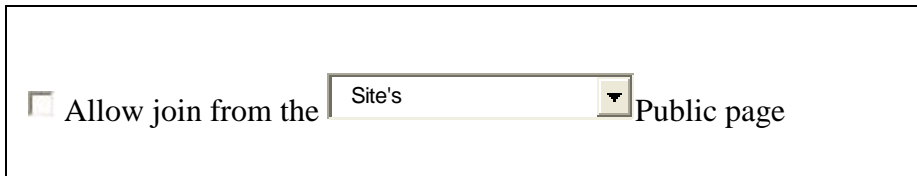
Figure 1.5- Public Session option